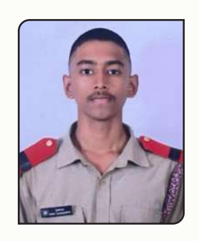
B.Com Represented Karnataka & Goa Directorate in Republic day Parade